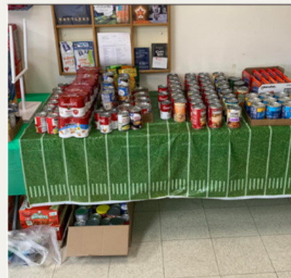
It's SOUP-ER BOWL Time!!! FBC Atchison, like many others are collecting non-perishable food items to donate to local pantries. They are at 366 of their 500 goal.