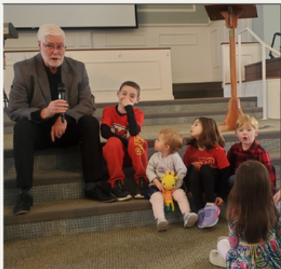
Prairie Baptist Church intentionally include children in the life of the church where they are treasured for their presence, questions, and insights.